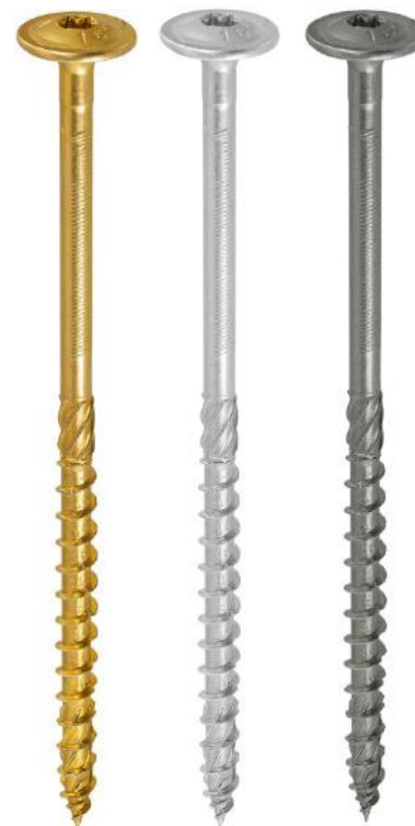
Zn - yellow Zn - blue* SQ ceramic* *item on request and to order